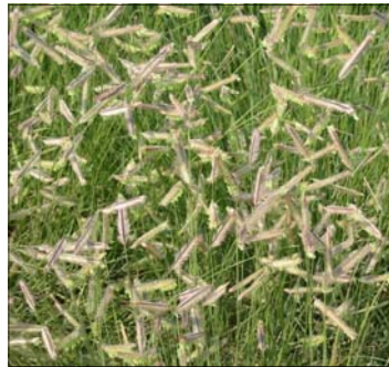
The plots will feature a mixture of prairie grasses and wildflowers.

To book a Prairie in the Park speaker for your neighborhood or civic group meeting, call 402.554.4010.