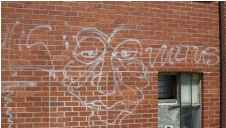
The volunteers will focus on trash and graffiti removal.