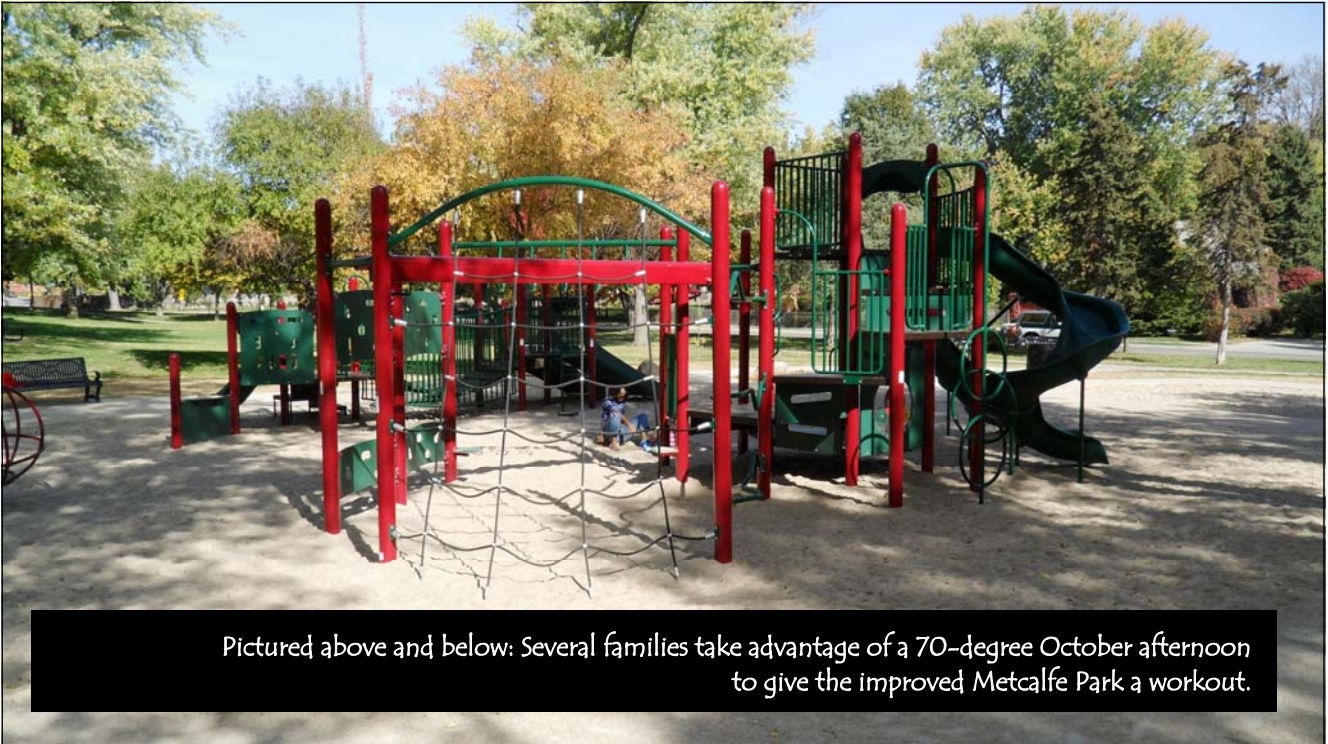
Pictured above and below: Several families take advantage of a 70-degree October afternoon to give the improved Metcalfe Park a workout.